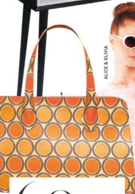
ALICE & OLIVIA